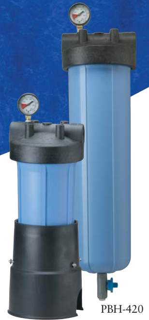
PBH-410 (shown with bag vessel stand)